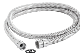
1.5m Anti-twist Hose - Chrome REHOSE150C